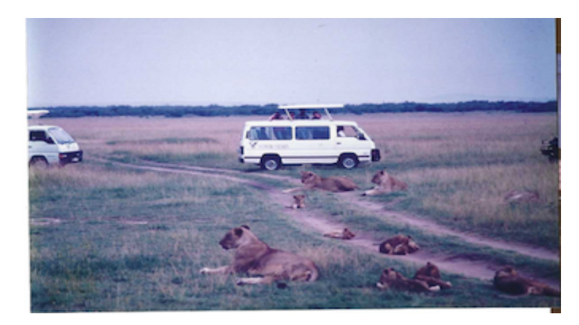
Lion Day Care!