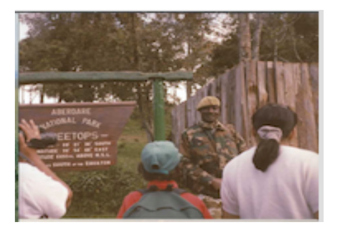
A Range at the entrance to TREETOPS in Aberdare National